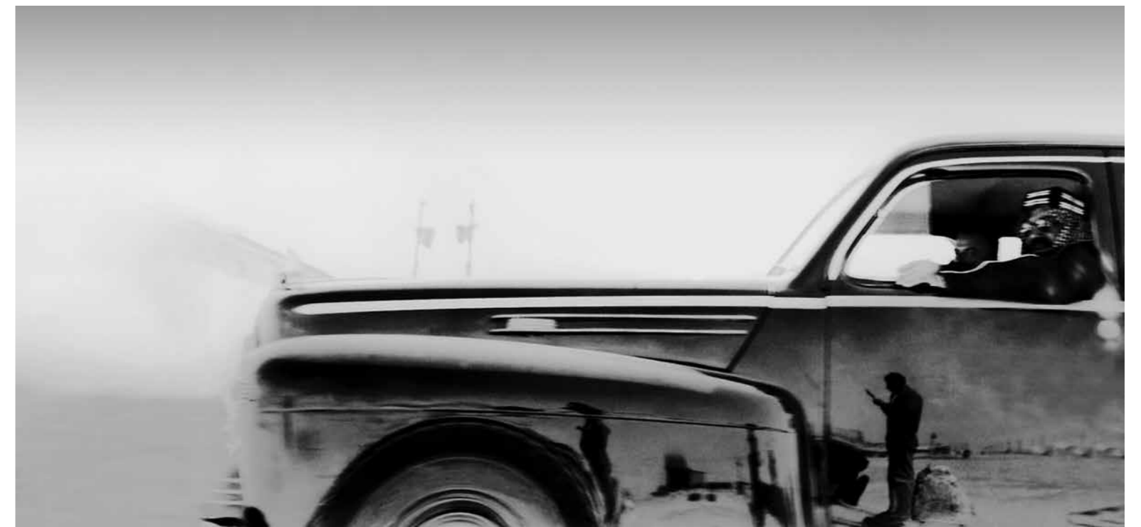
Sultan bin Fahad 1440 M , 2016 Gelatin silver print 298 x 163.8 cm

This framed photograph shows the founder of Saudi Arabia, King Abdulaziz Al Saud, sitting in a car next to the driver. The picture was captured during the first phase of petroleum discovery in the kingdom, as the king inspected the oil wells. Bin Fahad flips the image using a gelatin silver process, placing the late king into the driver's seat instead. He is now the driver, in control and is driving Saudi Arabia into the future. The number '1440 M' refers to the moment when King Abdulaziz ordered Aramco to dig deeper than 1,440 metres, the point at which oil was found at this geological depth.