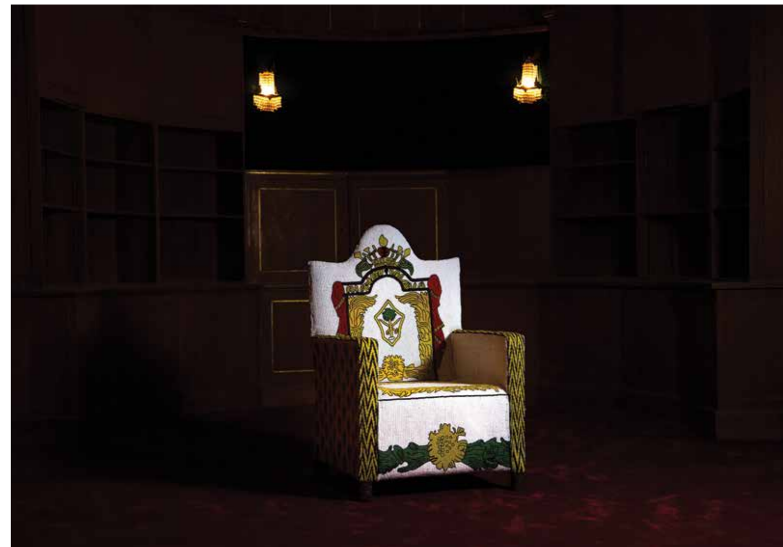
Sultan bin Fahad Chinese Whispers , 2019 Cloth and plastic beads 90 x 90 x 110 cm

While the emblems and motifs are from Saudi Arabia, the colours used are combinations associated with African culture. The artist is interested and even encourages these variations and cultural interpretations, bridging West Africa, West Asia and South Asia, and trust becomes the basis of these cross-cultural relations.