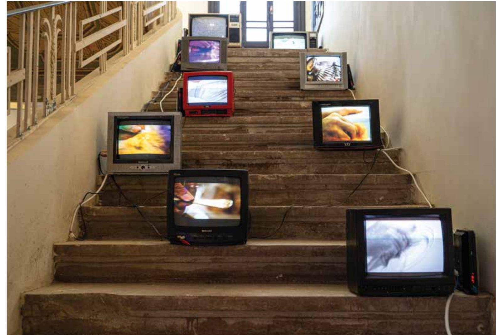
Sultan bin Fahad Labor III: Polishing , 2019 Multichannel digital video installation with sound, two minutes, 21 seconds

The artist began researching the etiquette of preparing and serving food, examining photographs of cooks and details of the royal dinner preparations during King Saud's reign. In this work, Sultan bin Fahad dissects the conventional boundaries of labour and delves into its meaning. In Labor III: Polishing , videos were filmed depicting hands cleaning, polishing and simulating the palace work of the time. The artist re-enacted these situations and shot these actions, presenting the images on a loop. By focusing solely on the hands, this is a timeless reference to nameless labour.