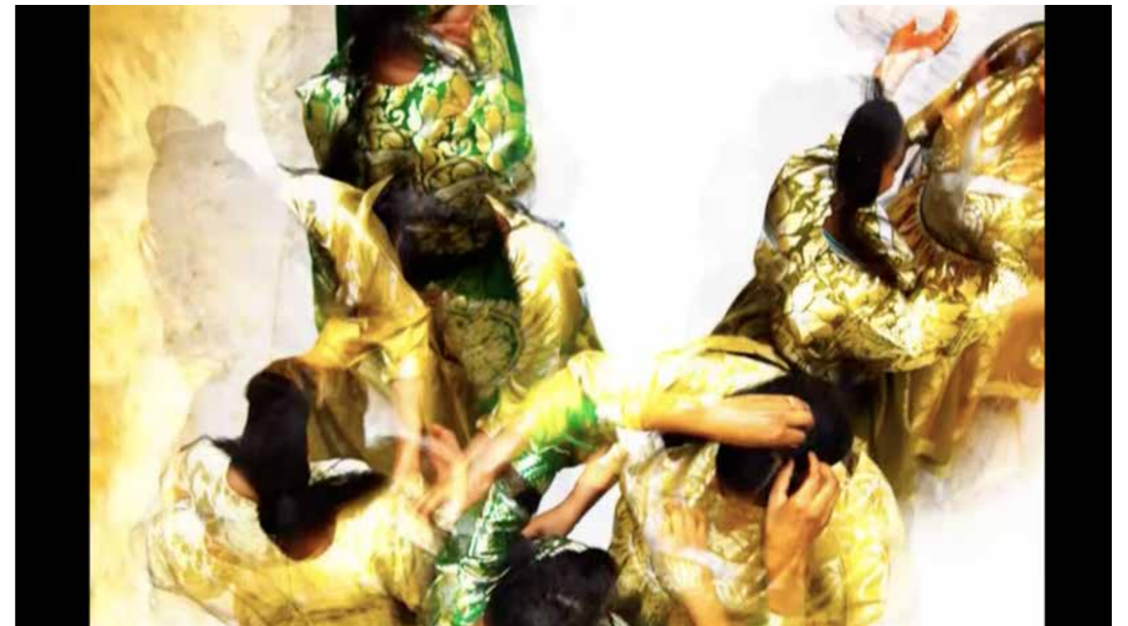
Sultan bin Fahad Labor I: sufrah wa sayah , 2019 Two-channel digital video installation, with sound, two minutes, 21 seconds each