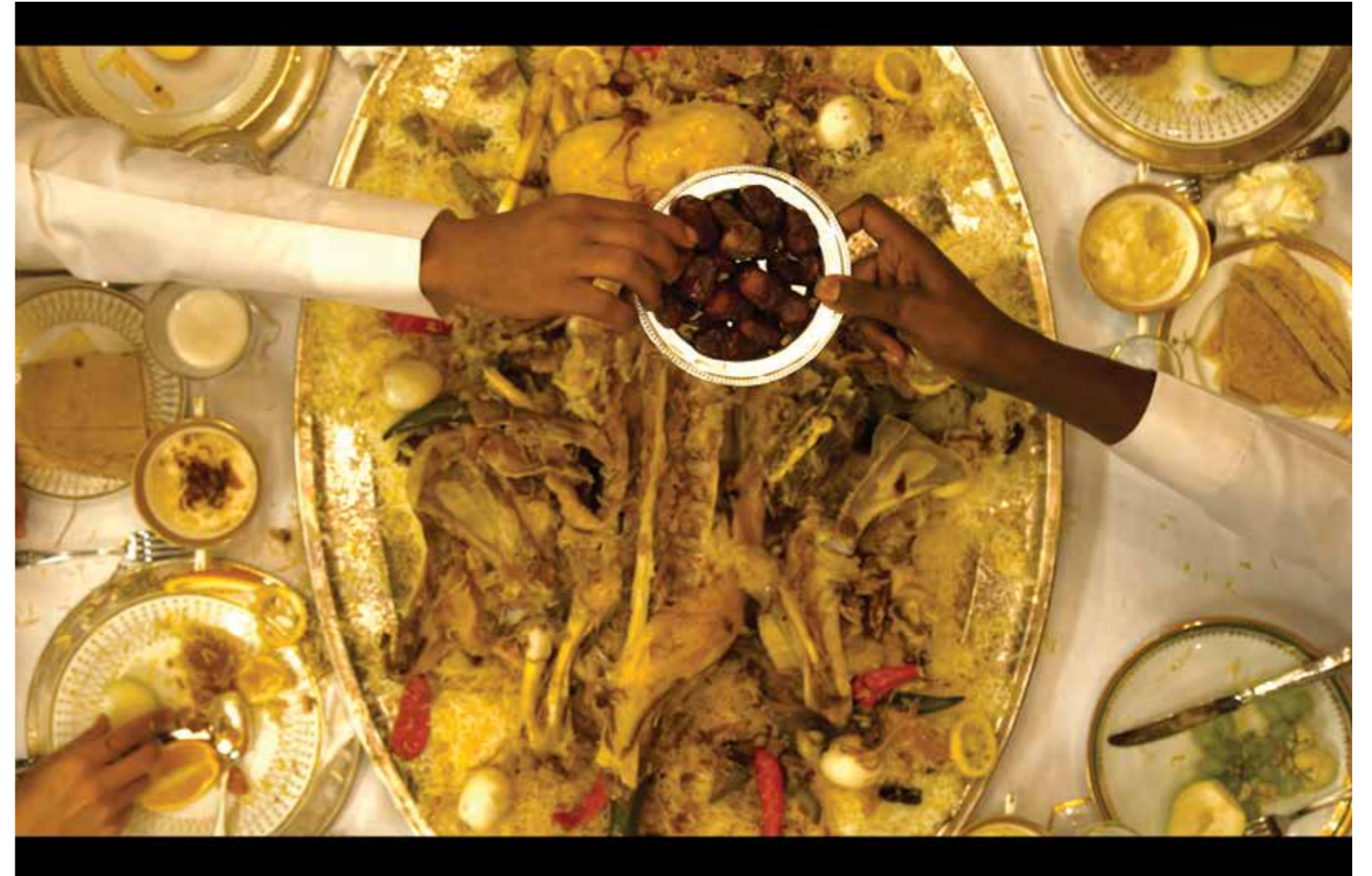
Sultan bin Fahad Dinner at the Palace II , 2019 Single channel video 3 minutes, 14 seconds