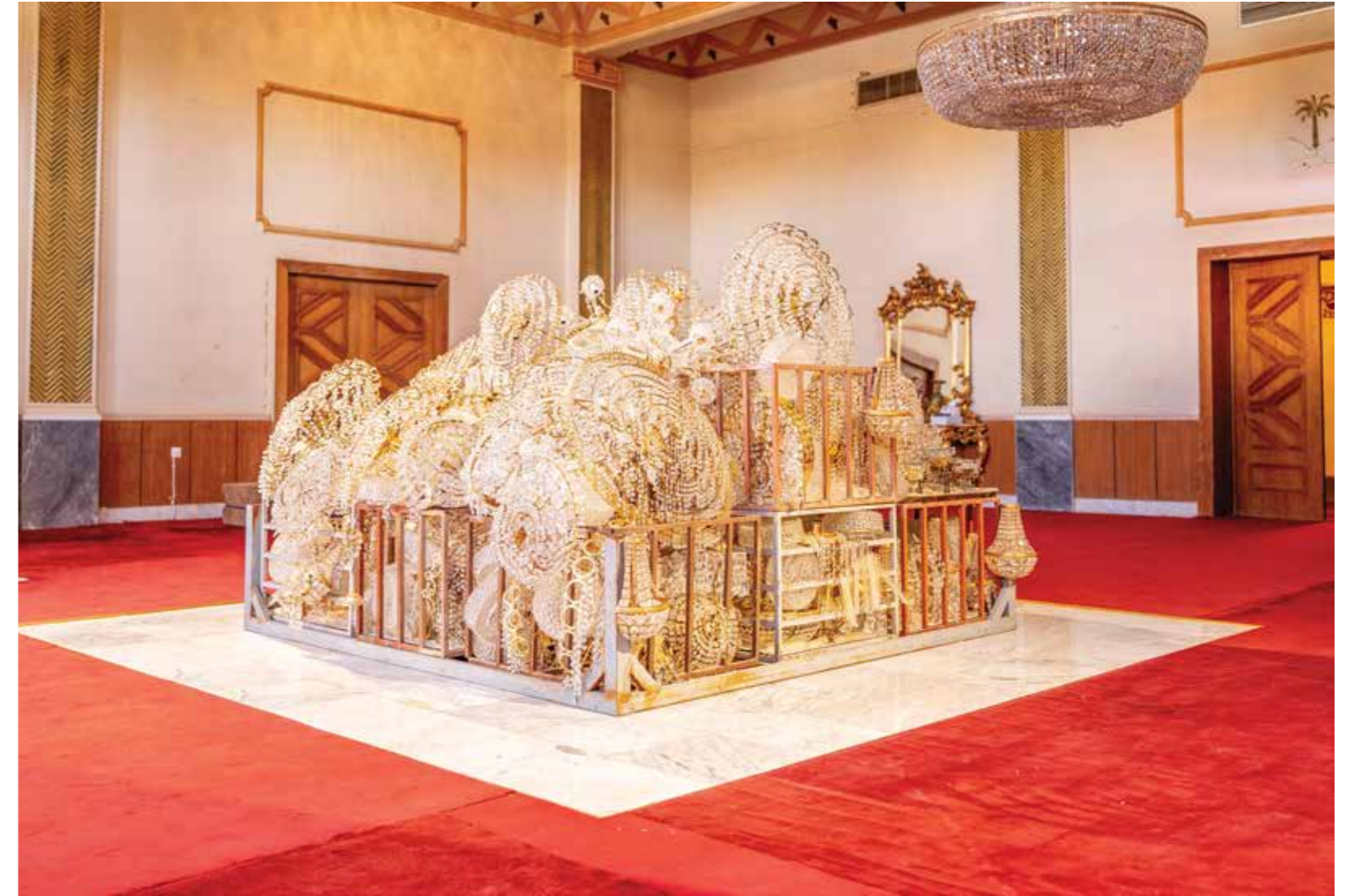
Sultan bin Fahad To Dust , 2019 Crystal, brass, copper, steel and mirror Dimensions variable

This installation consists of disused chandeliers sourced by the artist from the Red Palace. They are placed inside rusty steel cages of old air-conditioning units, also from the palace, while shards of glass protrude from the surrounding bars. This work draws a contrast between material wealth and the decaying palace ruins, reminiscing on its rich history.