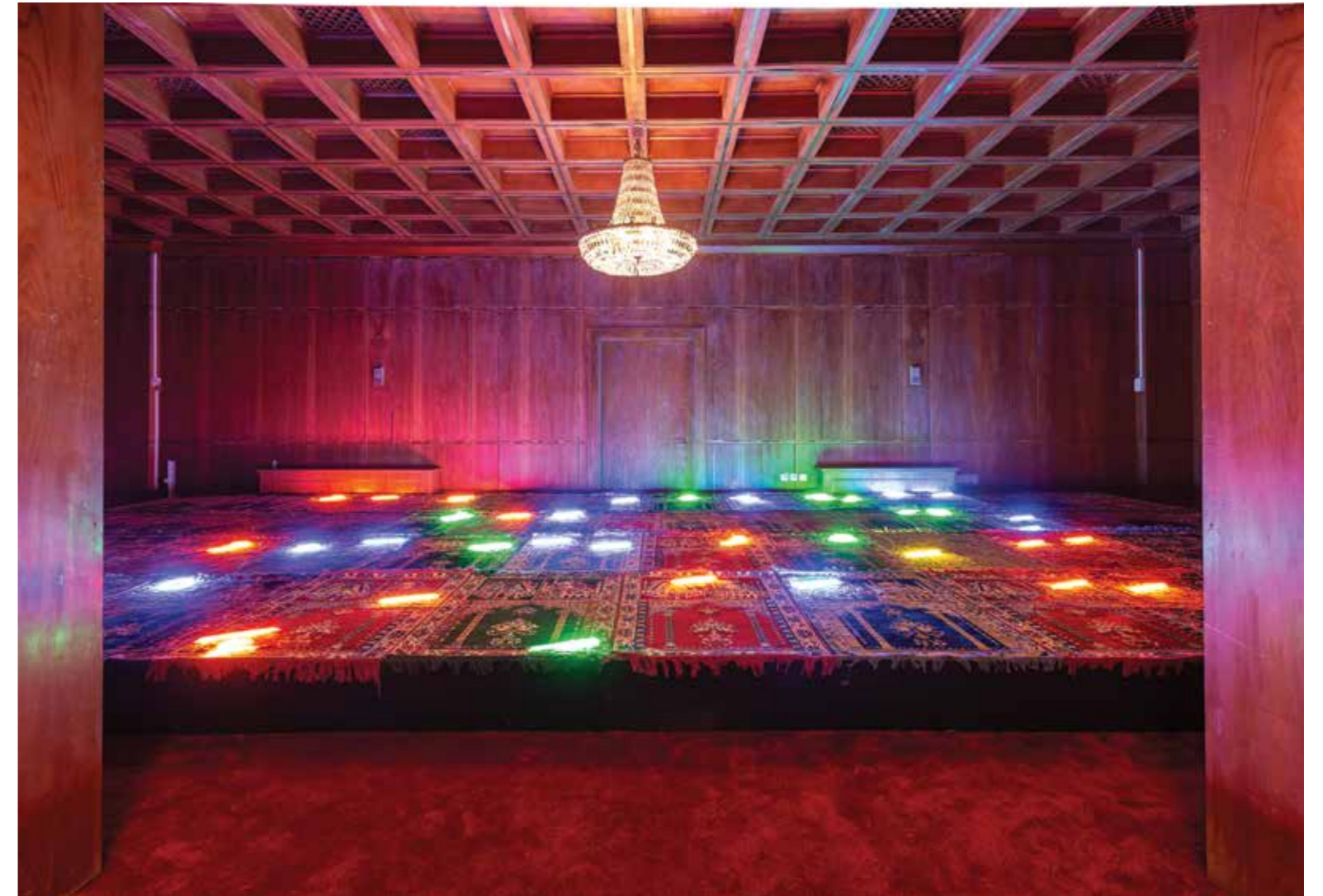
Sultan bin Fahad Prayer Room , 2019 Rugs and neon 471 x 671 cm

In this work, the artist draws a parallel between the spoken word, the absent letters and the collective of bodies, making corporeal what we do not perceive.