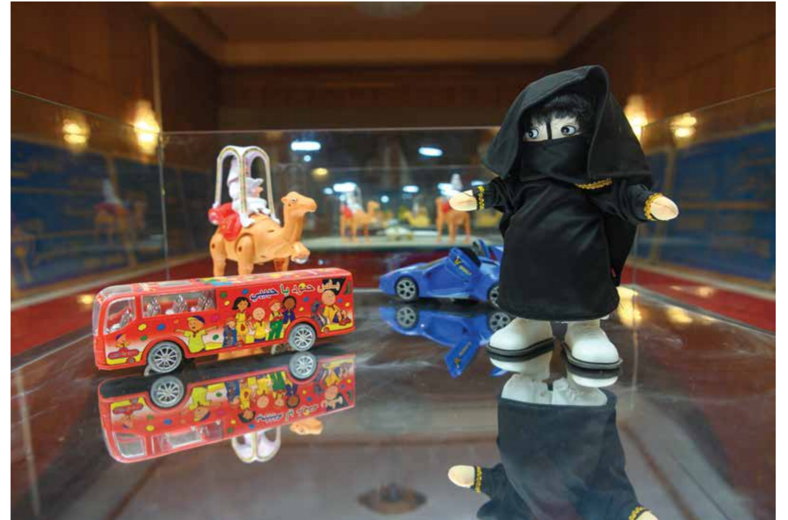
Sultan bin Fahad Loop II , 2018 Fibreglass, mirror, plastic toys Dimensions variable

A row of mirrored display boxes contains several small plastic dancing and singing toys made in China. When switched on they move haphazardly within their containments. These toys absurdly reference Islam or Mecca with stereotypical Orientalist tropes from the East and fuse various cultural ideas, translations and misrepresentations. For example, an airplane that sings out Islamic prayers with disco lights, or a maharaja-like figure adorned with a turban reading the Holy Qur'an on a camel. These objects are a direct reference to the hybridised and intertwined economies and cultures of holy sites.